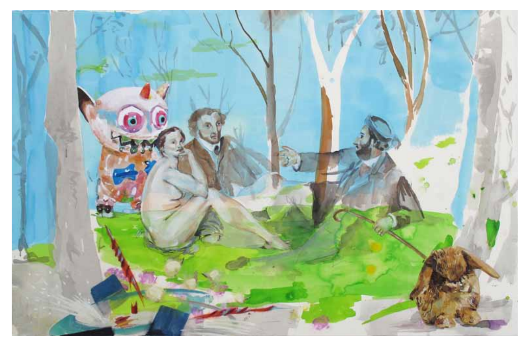
Déjeuner surprise, 2012, 92 x 142 cm, watercolor, gouache, ink on paper