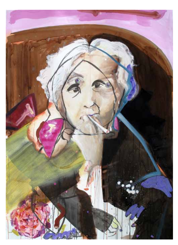
Mère ou femme de l'artiste, 2012, 145 x 112 cm, watercolor, gouache, ink on paper