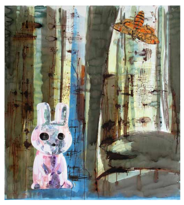
Die Fette Motte, 2012, 140 x 130 cm, watercolor, gouache, ink on paper