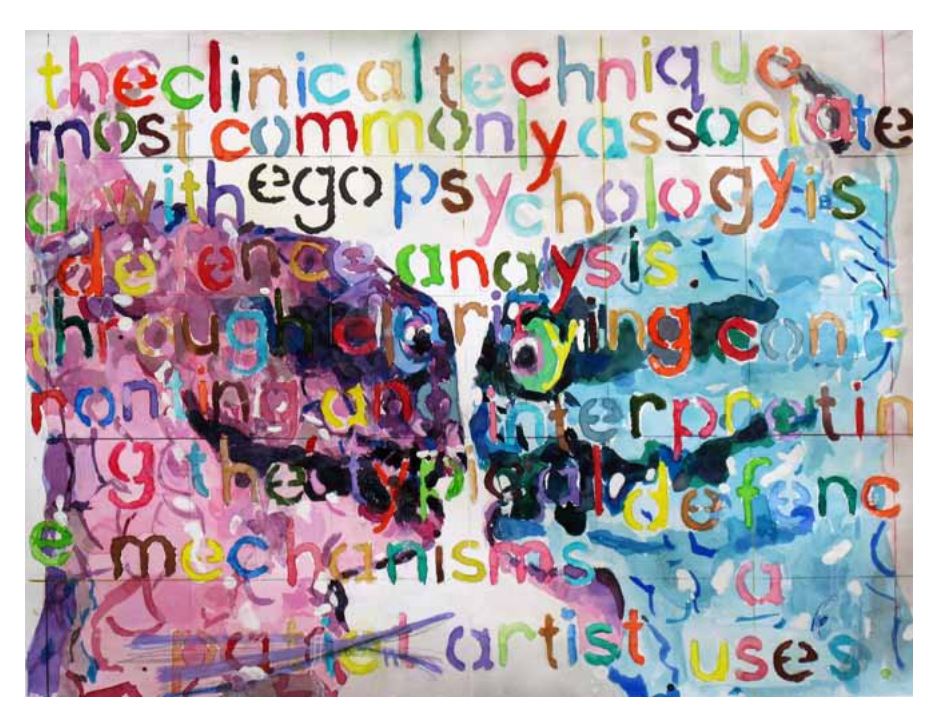
Kunst und Ego, 2012, 50 x 65 cm, watercolor, gouache, ink on paper